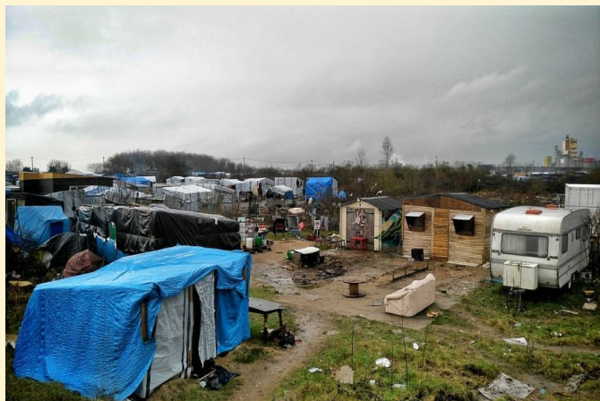
Calais (France)

Against the background of the different national experiences of providing medical treatment to refugees, in particular during the migration waves in 2015, the CPME Board has adopted a statement which puts fundamental rights and medical ethics at the heart of the debate. To ensure effective access to healthcare for every refugee, CPME proposes to integrate them into the existing healthcare systems. This ensures equal treatment and avoids the administrative burdens a parallel system would entail. The principle of equality is also reaffirmed in relation to the patient-physician relationship and the right to confidentiality. As provided for in codes of medical ethics, doctors have professional obligations to maintain patient confidentiality and to act in the best interest of the patient. They may not be pressured into breaching this and are encouraged to openly speak out against attempts by authorities to challenge these principles. CPME continuously highlights these obligations, also with regard to healthcare for undocumented migrants . In concluding discussions, CPME members confirmed the importance of the topic and the potential for exchange and implementation of good practice. To this end, CPME will create a working group on the health of refugees and undocumented migrants.